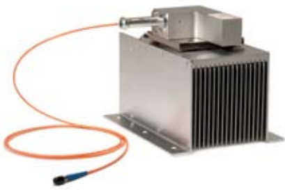
Optional heatsink assembly